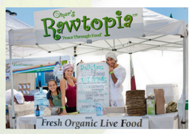
At EarthWell, we are ready for a great new festival in 2012, and we hope you will join us.

877-500-6575 | www.earthwellfestival.org | info@earthwellfestival.org